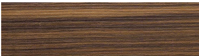
LK00 palissandro makassar