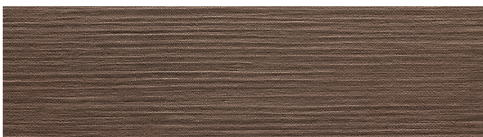
LG60 larice grafite