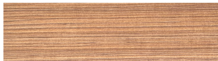
LK88 noce daniela