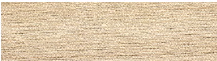
LK05 light teak eleganza