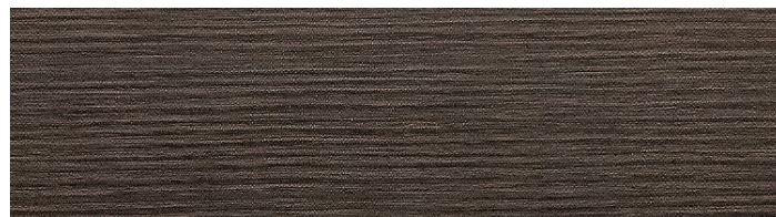
LG18 dark rovere