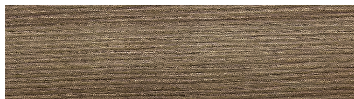
LK34 dark ciliegio marbella