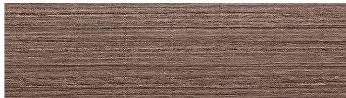
LG99 dark teak eleganza