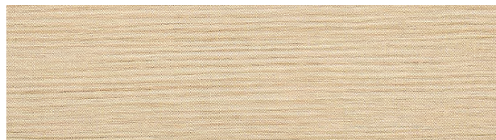
LG23 light rovere