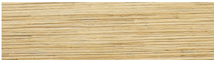
LK09 bambu seagrass