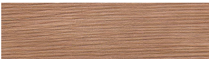
LG69 light ciliegio marbella